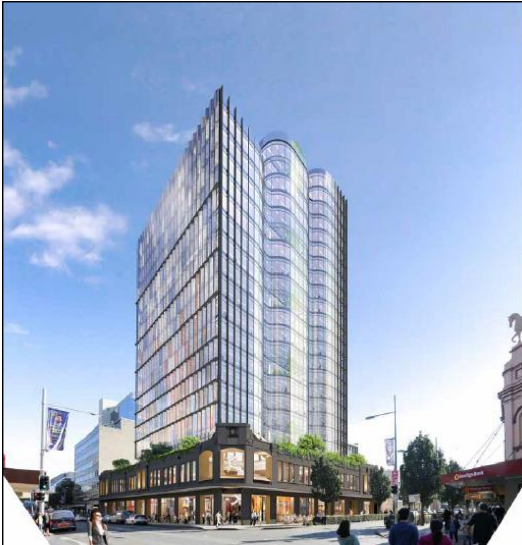
Figure 1. 3D View of the new design (Source: Turner, 197 Church Street St Parramatta Urban Design Report, October 2019).